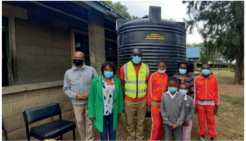
REREC staff donates water tank to Baharini Primary School

When COVID 19 hit Kenya for the first time in March 2020, the Ministry of Health came up with measures that would help prevent the spread of COVID 19 among the communities. One of the measures was washing hands. However, in most households and schools in Kenya, water is scarce and in some cases very expensive. Considering this fact on the 3rd of September 2021 REREC officials visited Baharini Primary School in Kivumbini ward Nakuru Town East Constituency and donated a water tank to aid in the reservation of water for cleaning, drinking, washing hands, and other uses.